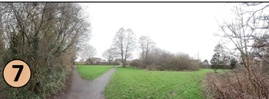
Woodland edge between The Triangle and Spinney Wood character areas. Opportunity to soften edges and improve visual sight lines