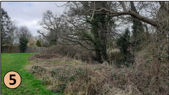
Overgrown interface with Mill Brook. Opportunity to create a direct connection with running water and as a place for dwell time.