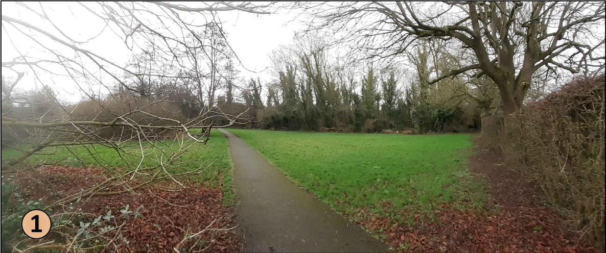
Entrance into The Triangle looking towards St Albans Church -opportunity to frame view of church, filtered views into Spinney Woods and a footpath connecting the alleyway opposite.