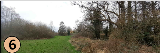
View from Mill Brook towards the scrub.