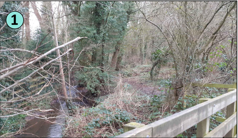
Existing entrance into Spinney Wood off Timber Bridge crossing Mill Brook