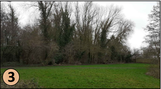
View towards The Spinney Wood. Opportunity to create a more filtered interface which interlinks both character areas