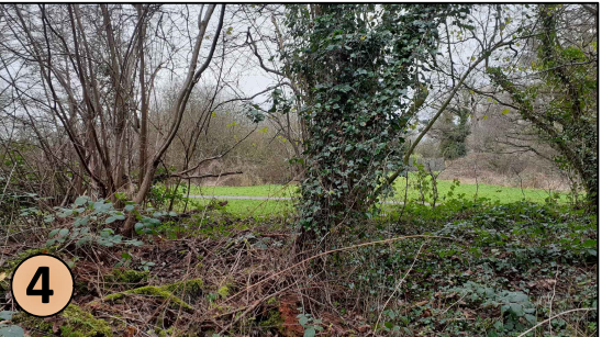
View from within Spinney Wood, looking towards The Triangle