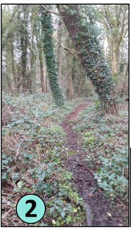
Existing desire line