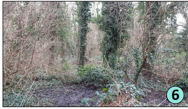
Wet and boggy understorey