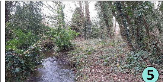
Dense Woodland Canopy