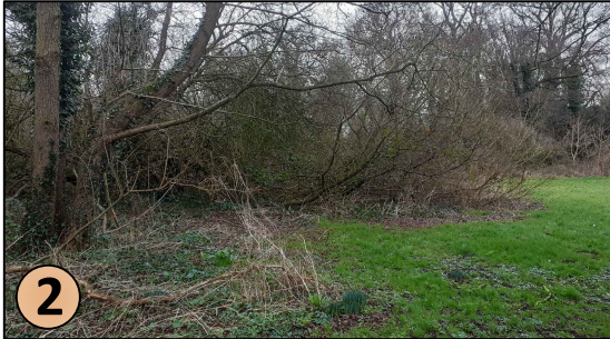
Existing damp Scrub -opportunity to create water feature/ small pond