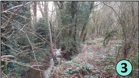
Attractive waterside corridor through Wood