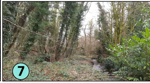
Opportunity to create viewpoint