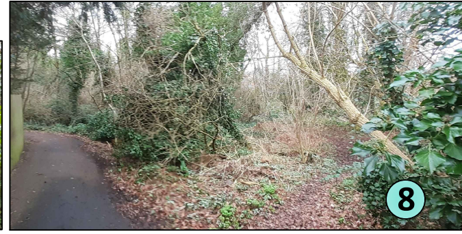
Entrance near Spinney End -view into Spinney Wood