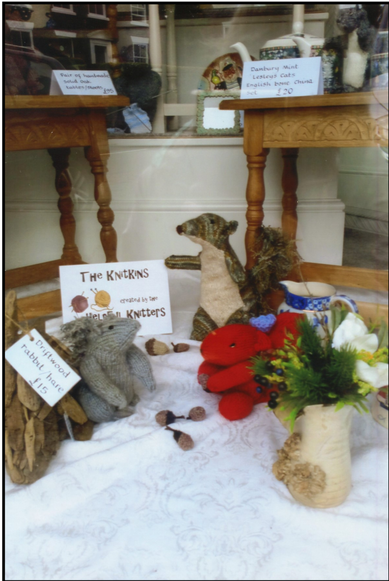
Rhoyda's front window