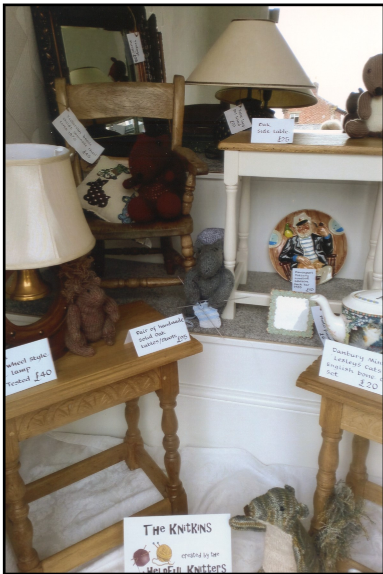
Rhoyda's front window