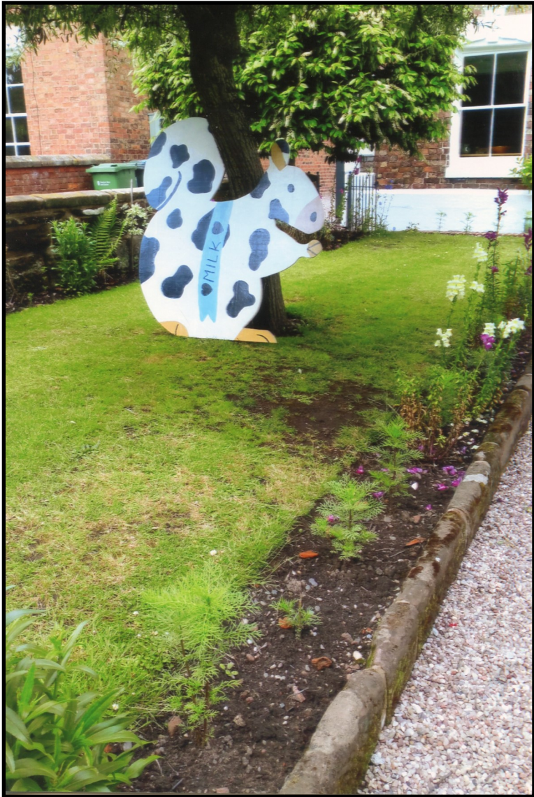
Laurel bank Garden

A nod to the dairy industry in and around Tattenhall