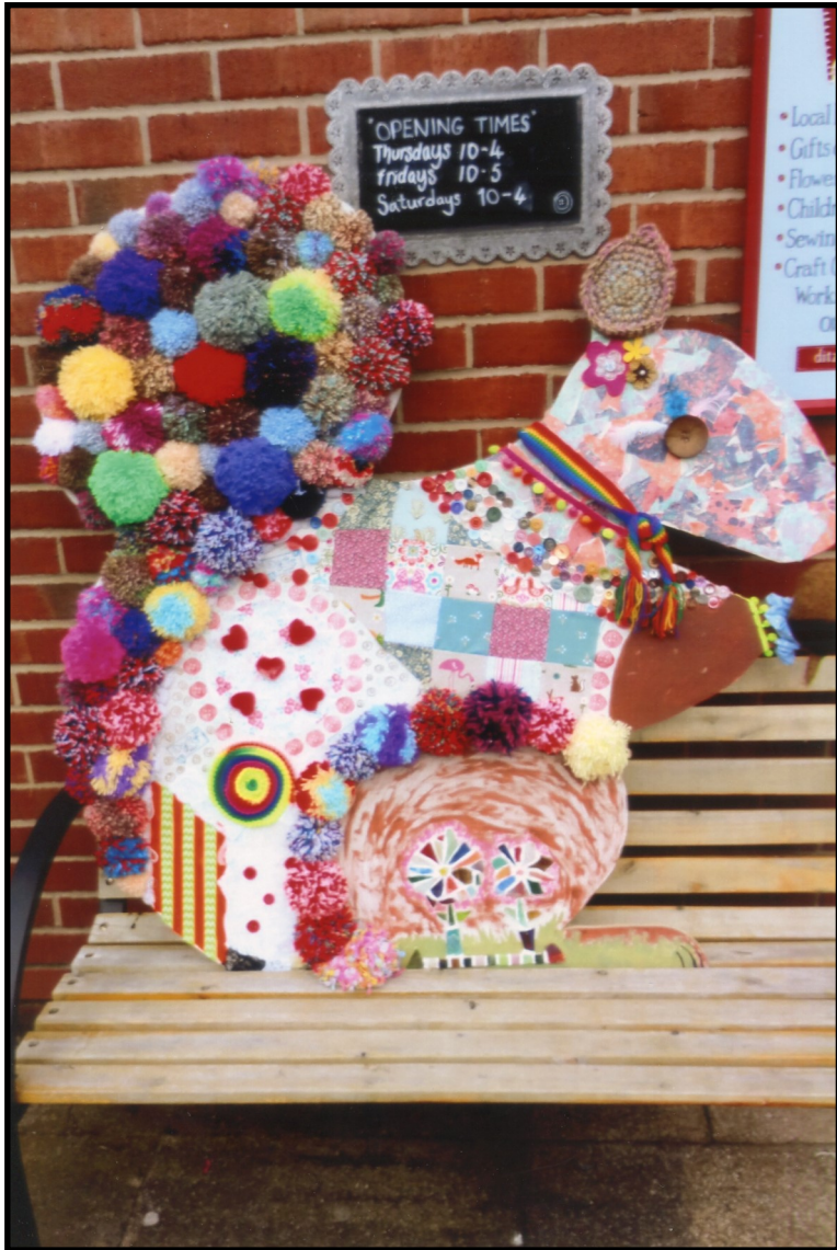
Ditzy Rose Makery Shop