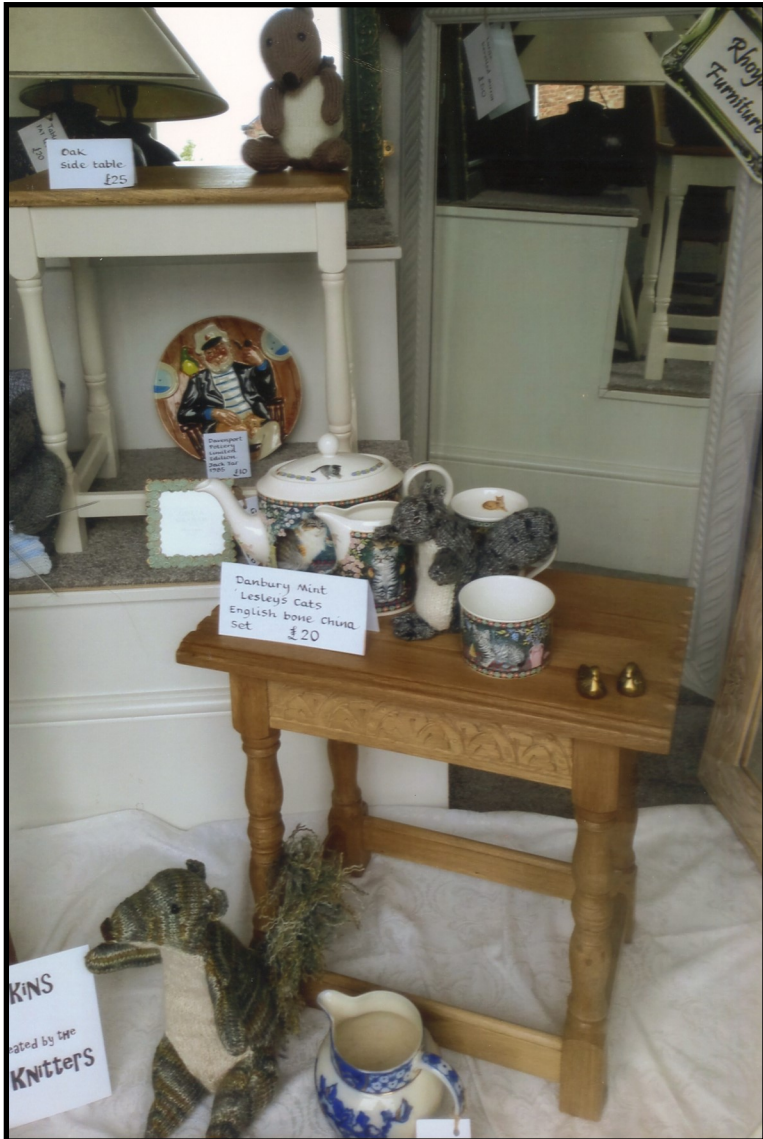
Rhoyda's front window