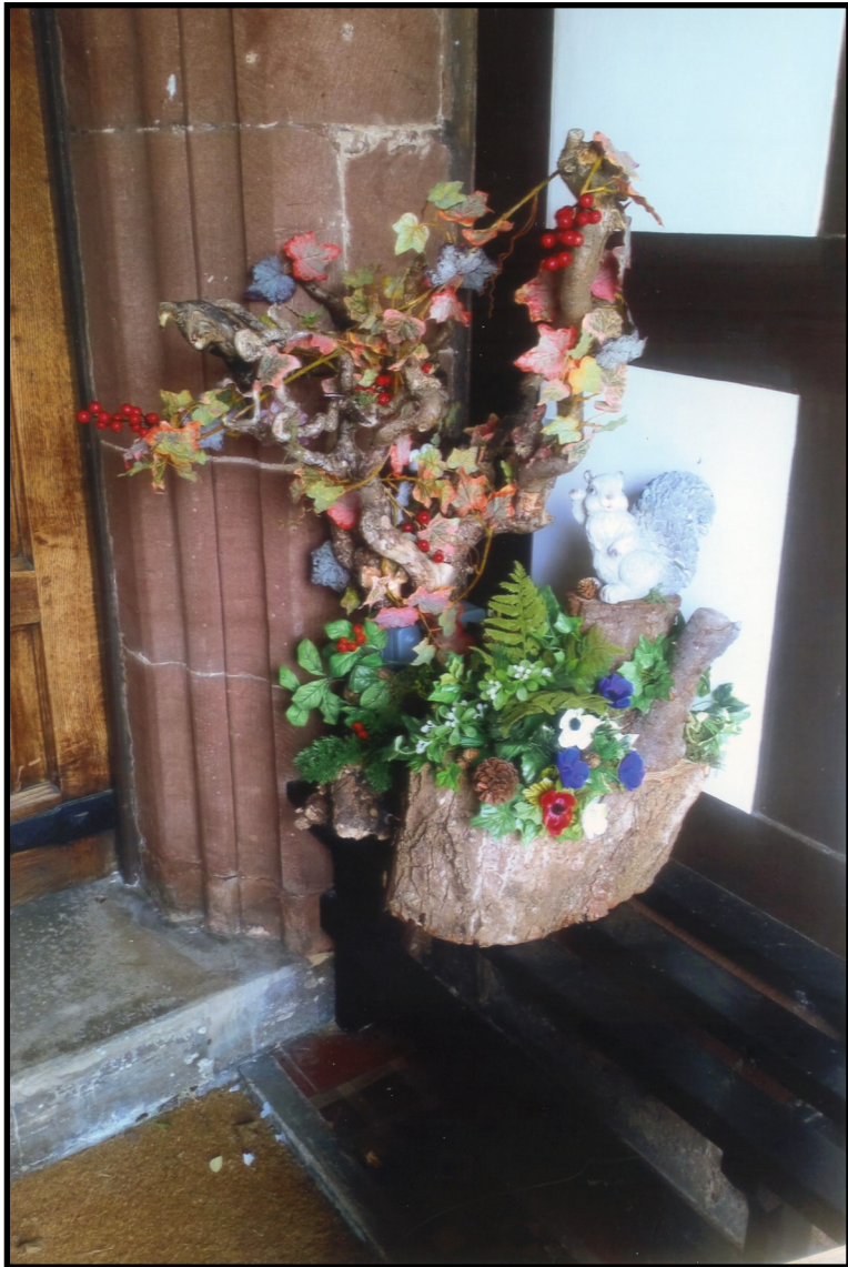
Church Front Porch