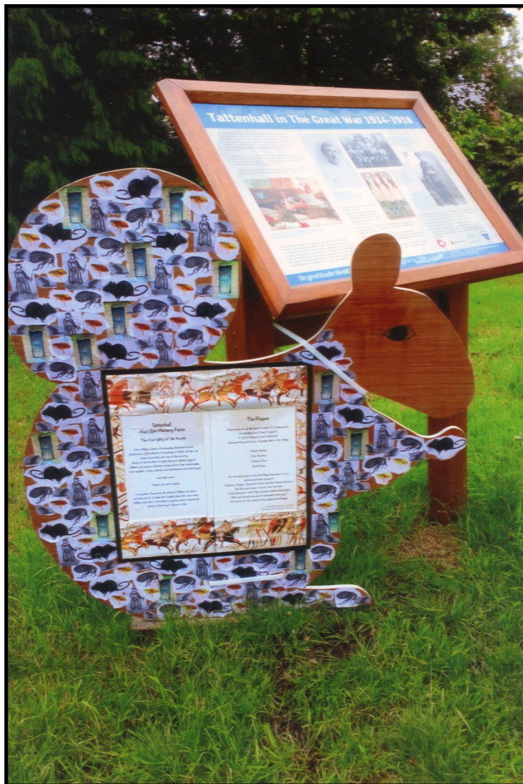
Interpretation Panel opposite Millfield