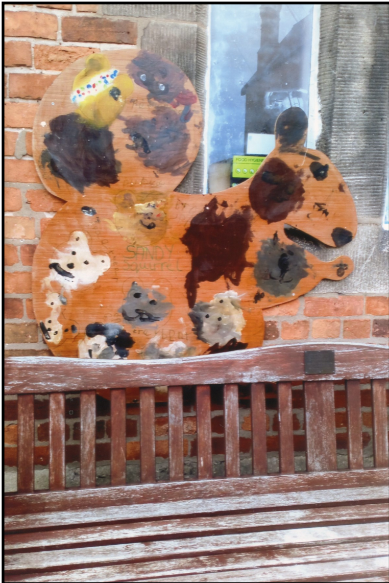
Outside Bear's Nursery