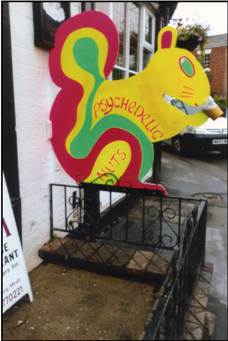
The Letters Inn